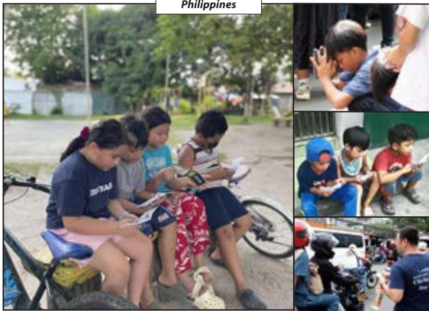
Adults and children are given the gospel all over the Philippines!