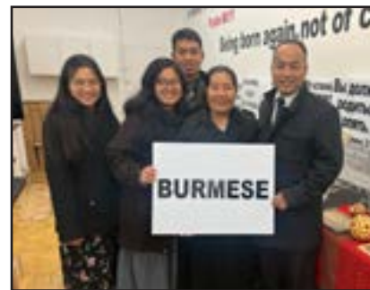
This family found tracts in their native language at the Tract Palace!