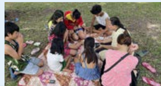
Group of Filipino children learn Jesus brings LIFE!

100% OF THE MONEY YOU SEND TO THE CHICK MISSIONS FUND IS USED TO SHIP LITERATURE TO MISSIONARIES.