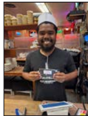
A Katz Deli employee excited for Chick tracts in his native language!