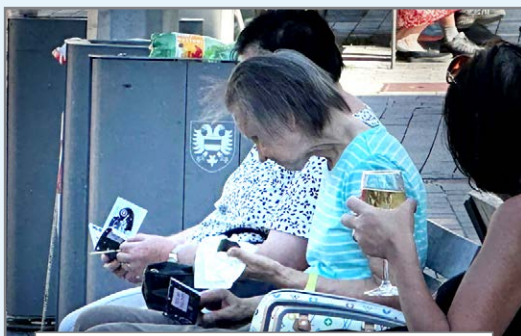
Ladies in Czech Republic intently read Chick tracts you provided.

100% OF THE MONEY YOU SEND TO THE CHICK MISSIONS FUND IS USED TO SHIP LITERATURE TO MISSIONARIES.