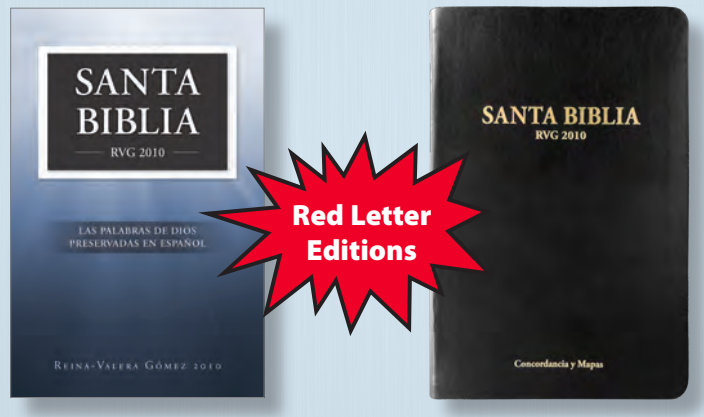
#2592 Paperback $12.95

Both Bibles are printed in an easy-to-read typeface carefully chosen for RVG Bibles.