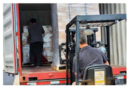
Loading the container.