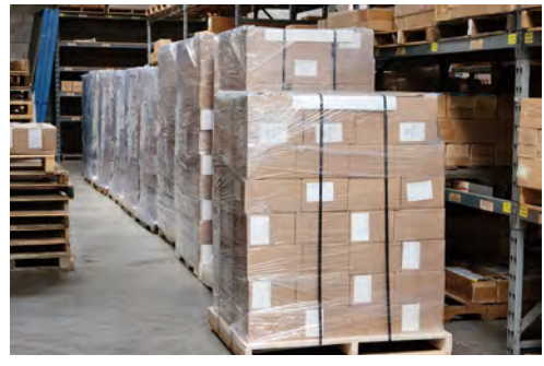
ONE MILLION tracts, ready to go to sea.

More than ONE MILLION Chick tracts have been shipped by ocean container to the Philippines, thanks to your giving. At the time of this writing, the container had just left a port in Taiwan and will soon be in Manila. After arriving in Manila, the container will be opened and