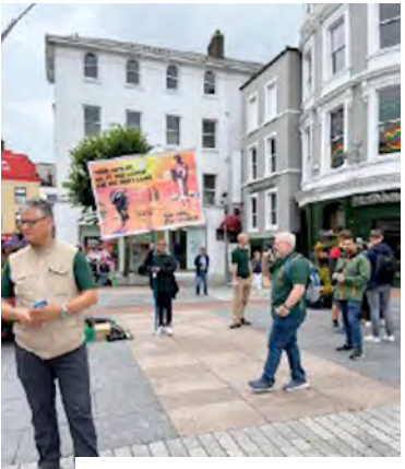
Street preaching in Ireland (and passing Chick tracts)

He said, "Of course, we had a regular amount of trouble with the police, the hecklers, the drunks and the druggies, but nothing unusual. Pray for more laborers on this beautiful but spiritually dark island."